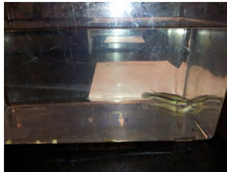
Chuck Pollet's Telmatochromis vittatus