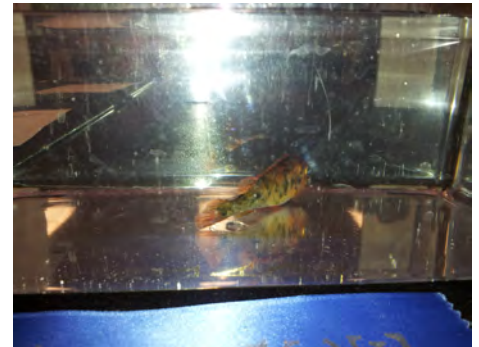
Bob Grauer's Neochromis caeruleus “Purple Muhuru”