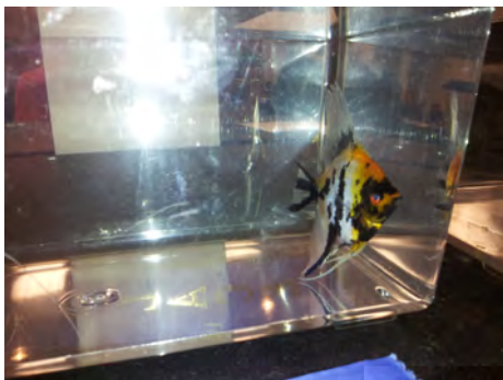
Dallas Barrett's Pterophyllum scalare